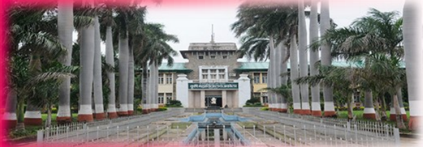
College of Agriculture, Akola