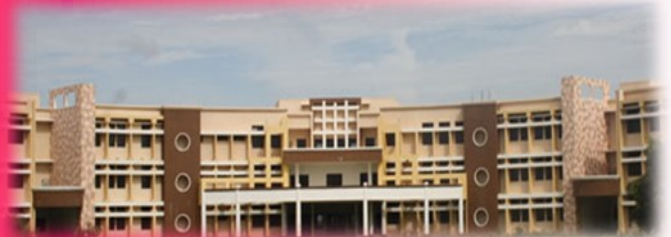
College of Agriculture, Gadchiroli