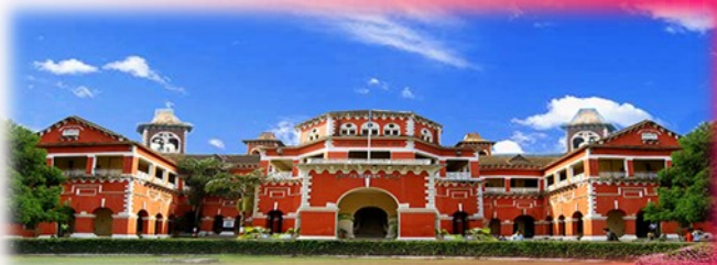
College of Agriculture, Nagpur