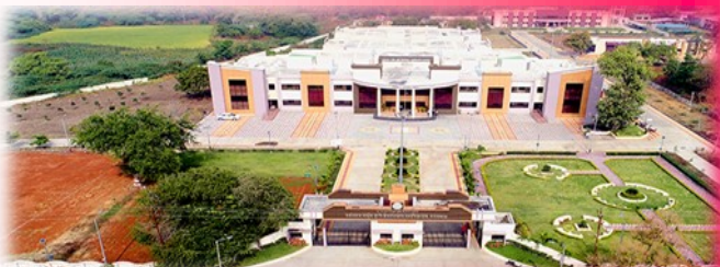
Vasantrao Naik College of Agril. Biotechnology, Yavatmal