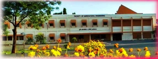
College of Agril. Engineering & Technology, Akola

It is requested to kindly attend the Dr. PDKV Alumni Meet 2019. Since the accommodation facilities are very limited in the university guest houses of Dr. PDKV, Akola. The participants are requested to make their own accommodation arrangement to nearby hotels. For more details please check www.pdkvnahep.org and www.pdkv.ac.in