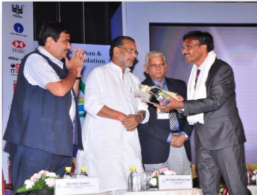
National Agri. Award-2014