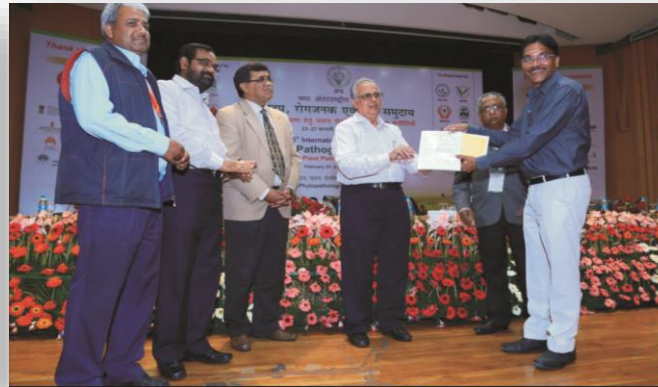
Fellow IPS Award