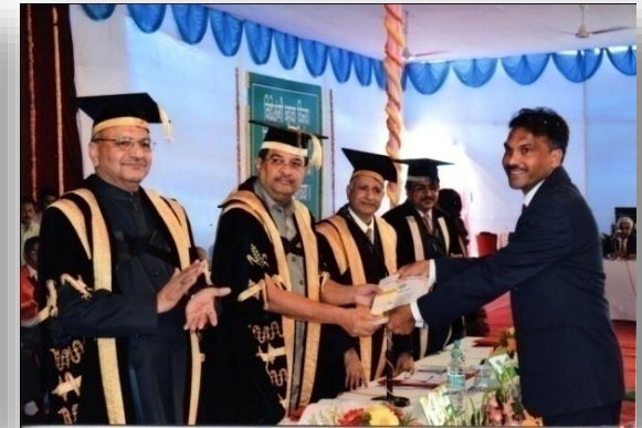
Best Teacher Award