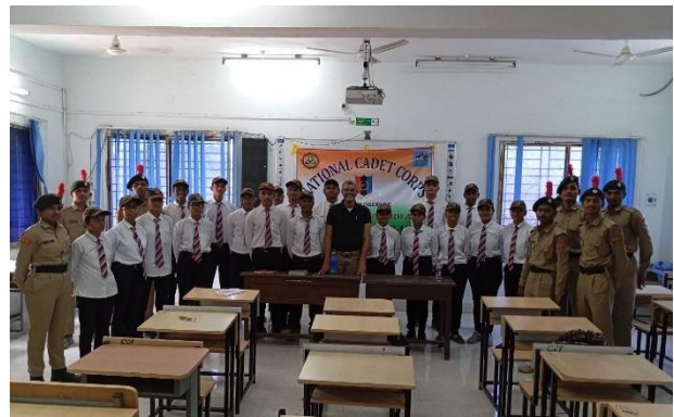
YOUTH LEADERSHIP AND CAREER DEVELOPMENT WORKSHOP ON 20 TH APRIL 2024