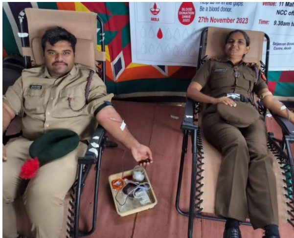
1 ST PRIZE IN BLOOD DONATION CAMP ON 27 TH NOV 2023 AT 11 MAH BN AKOLA