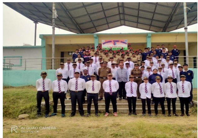
CELEBRATION OF NCC AND CONSTITUTION DAY ON 26 TH NOV 2023 IN PDKV CAMPUS