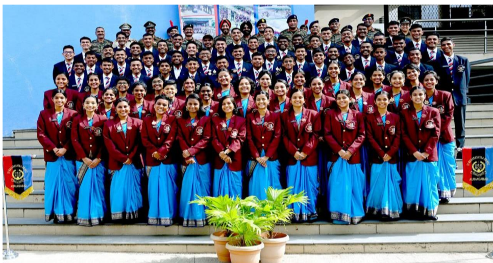
ALL INDIA THAL SAINIK CAMP 2024