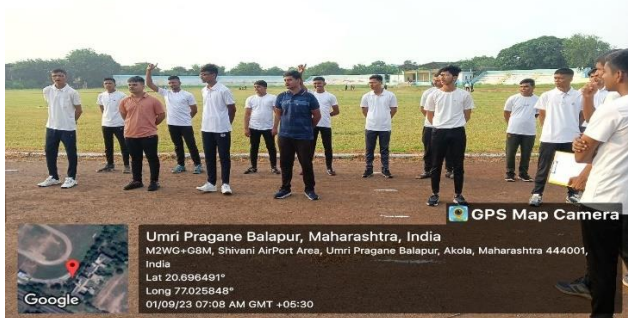
NEW RECRUITMENT OF 18 TH AUGUST 2023-24