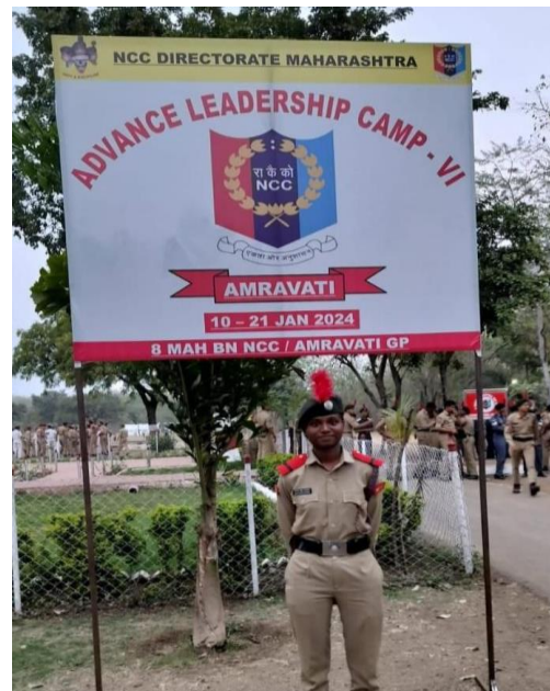
JUO NIRJA RASMWAR ADVANCE LEADERSHIP CAMP VI AMRAVATI 2024