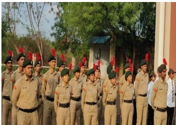
MAHARASHTRA DAY CELEBRATION AT VC OFFICE ON 1ST OF MAY 2023