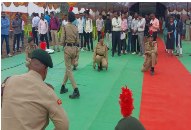
ON 14TH MARCH 2023 STREET PLAY 'MILLET KRANTI' PERFORMED BY CADETS AT SORGHUM GERmplasm FIELD DAY ARS ,WASHIM