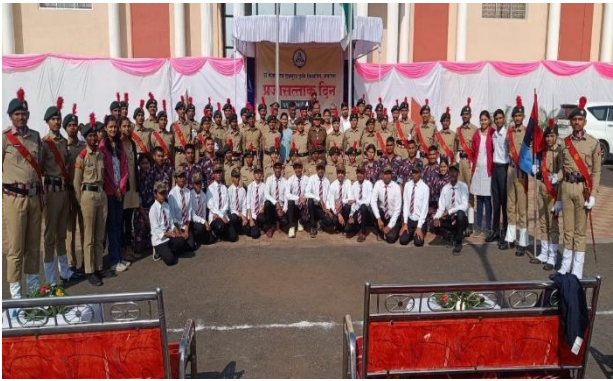
76 TH REPUBLIC DAY CELEBRATION 26 TH JAN 2024 AT VC OFFICE