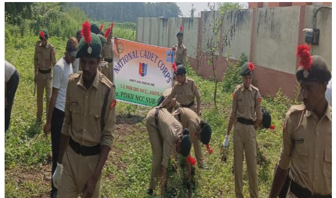
ON 1 ST OCT 2023 CONTRIBUTION IN GARBAGE FREE INDIA CAMPAIGN