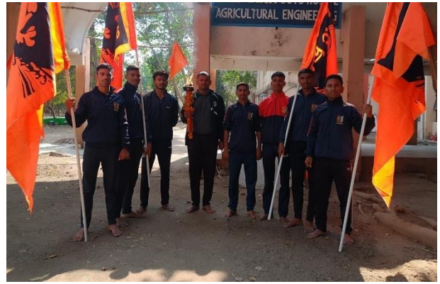
SHIV JAYANTI CELEBRATION ON 19 TH FEB 2024