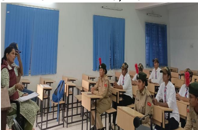
DEBATE COMPETITION ORGANIZED ON THE TOPIC ENVIRONMENT CONSERVATION AND PROTECTION AT COF ON 16TH MARCH 2023