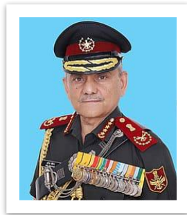
General Anil Chavhan Chief of Defense Staff