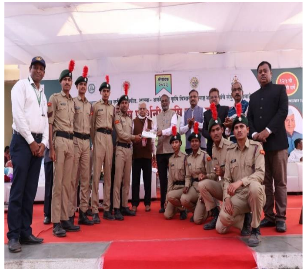
AGROTECH FROM 27-29 TH DEC 2024 AT DR. PDKV. UNIVERSITY GROUND AKOLA