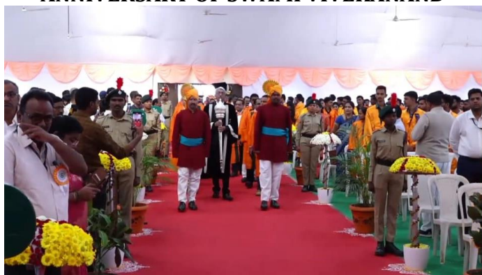
CADETS VOLUNTEERING 37 TH CONVOCATION ON 5 TH FEBRUARY 2023 AT CONVOCATION HALL