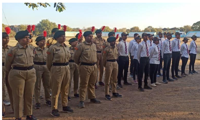
TRIBUTE PAYING CEREMONY TO PULWAMA MARTYRS ON 14 TH FEBRUARY 2023