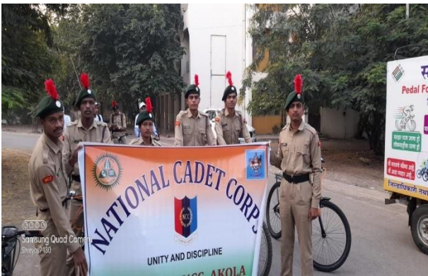
CYCLE RALLY ON 27 TH OCT 2023 TO PROMOTE POLUTION FREE INDIA