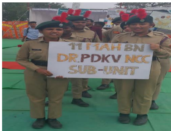
RALLY 'WALK AND TALK OVER MILLETS' LAID BY CADETS AT ARS WASHIM ON 14TH MARCH 2023