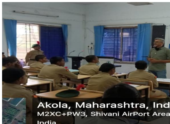
RALLY ON INTERNATIONAL DAY AGAINST DRUG ABUSE AND ILLICIT AFFICING ON 26TH JUNE 2023