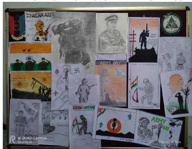
ARMY DAY CELEBRATION ON 15 TH JAN 2024