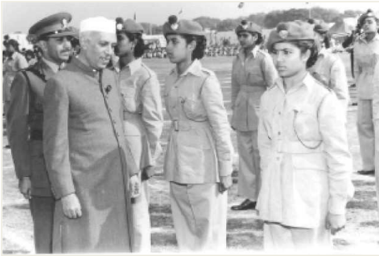
First Prime Minister of India Jawaharlal Nehru reviewing Guard of Honour