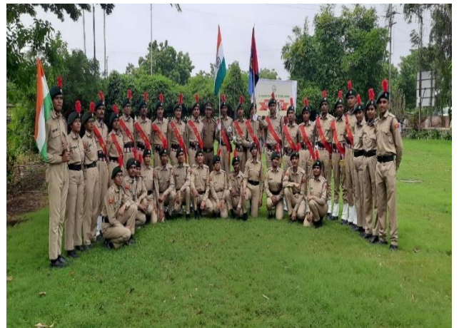
77 TH INDEPENDENCE DAY