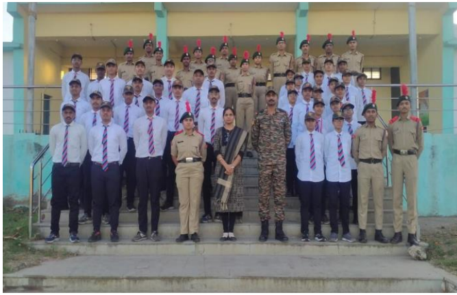
KARGIL VIJAY DIWAS 26 TH JULY 2023