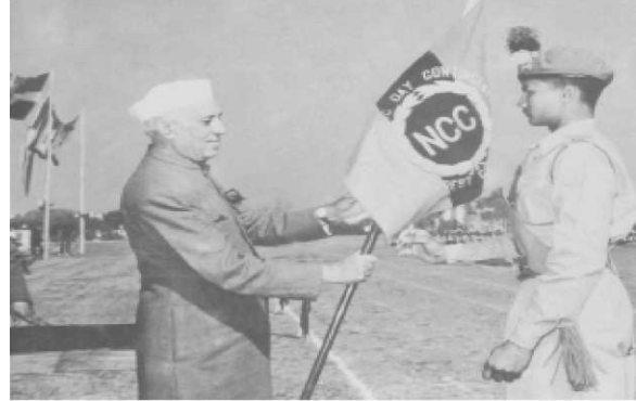
Pandit Jawaharlal Nehru presenting Republic Day banner