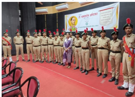
ON 14TH APRIL 2023 CADETS VOLUNTEERED IN BA CELEBRATION OF DR.BR AMBEDKAR AT THAKRE HALL