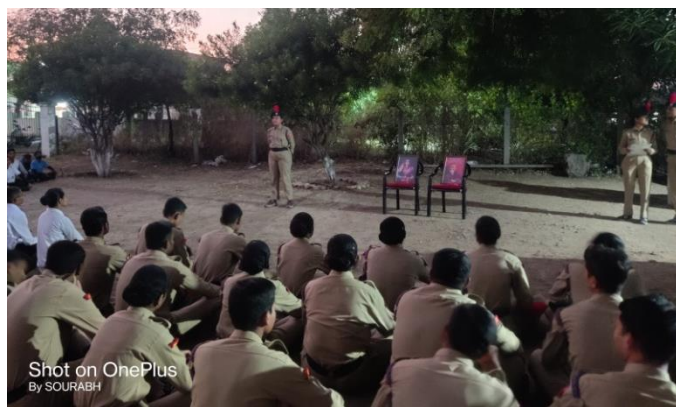
CELEBRATING NATIONAL YOUTH DAY ON 12 TH JANUARY 2023 TO COMMEMRATE BIRTH ANNIVERSARY OF SWAMI VIVEKANAND