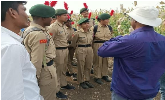
PARTICIPATION IN SHIVAR FERI 28 TH SEP 2023 DR. PDKV. NCC SUB UNIT