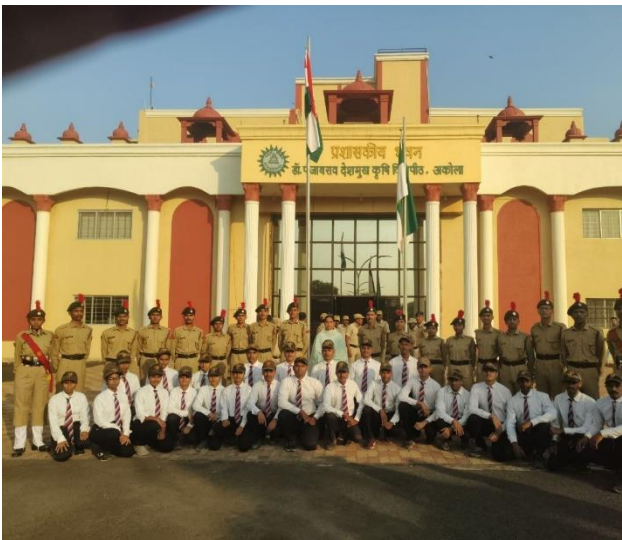
CELEBRATION OF MAHARASHTRA DIWAS ON 1 TH MAY 2024 AT VC OFFICE