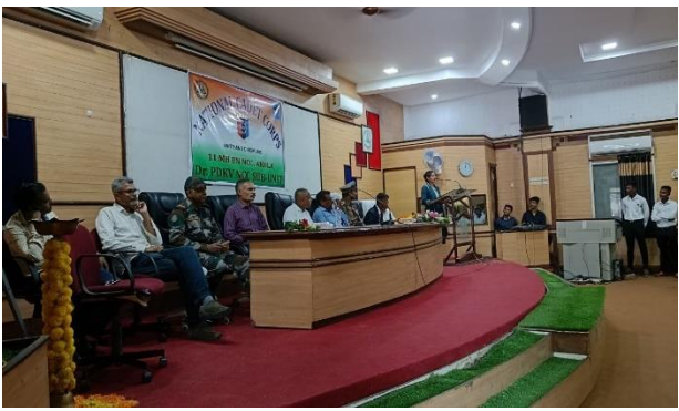
DR. B.R. AMBEDKAR ON 14 TH APRIL 2024