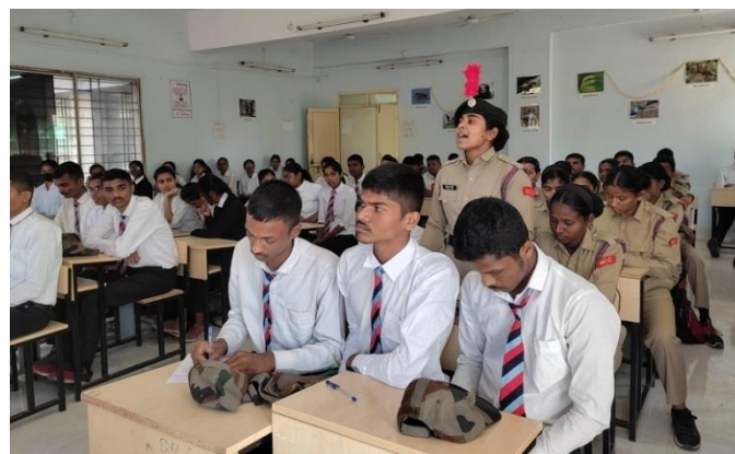
ORGANIZING DEBATE COMPETITION UNDER PUNNET SAGAR ABHIYAN ON 7 TH FEBRUARY 2023 AT COF.