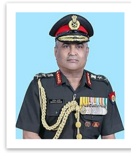
General Manoj Pande Chief of Army Staff