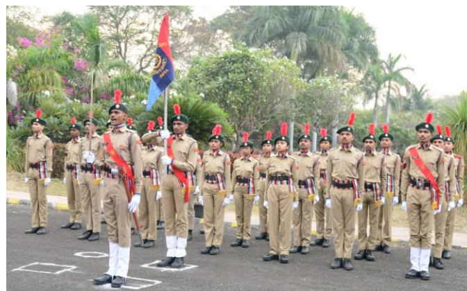
CELEBRATING 74 TH REPUBLIC DAY AT VC OFFICE