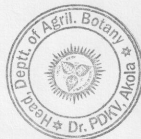
Head Department of Agril. Botany Dr. P. D. K. V., Akola